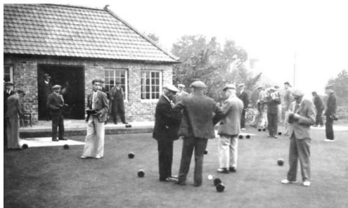
Saturday Evening Jumbles, circa 1947

Since the establishment of Ponteland Bowling Club one hundred years ago, there has been many changes to the buildings and organisation as the Club has grown and evolved to meet the changing needs of the local community.