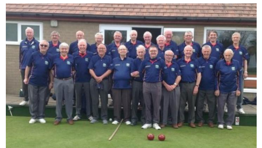
Members participating in BN League Competitions, 2017