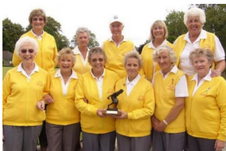
BN Top Club Trophy Winners, 2010

We have also seen changes in the Club's dress code over the years for both casual and competitive play. Each section has operated with a different kit, and in the case of the men's section even a different