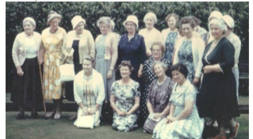
Ladies' Day, 1961