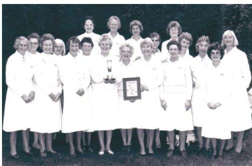
NCWBA Collins & Shipley League Winners, 1987

This situation changed in 1967 when a ladies' section was introduced, initially with twenty lady members.